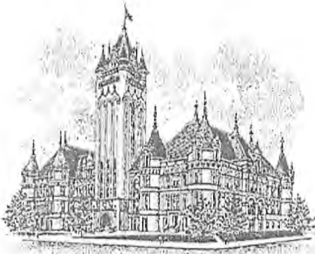
SPOKANE COUNTY COURT HOUSE